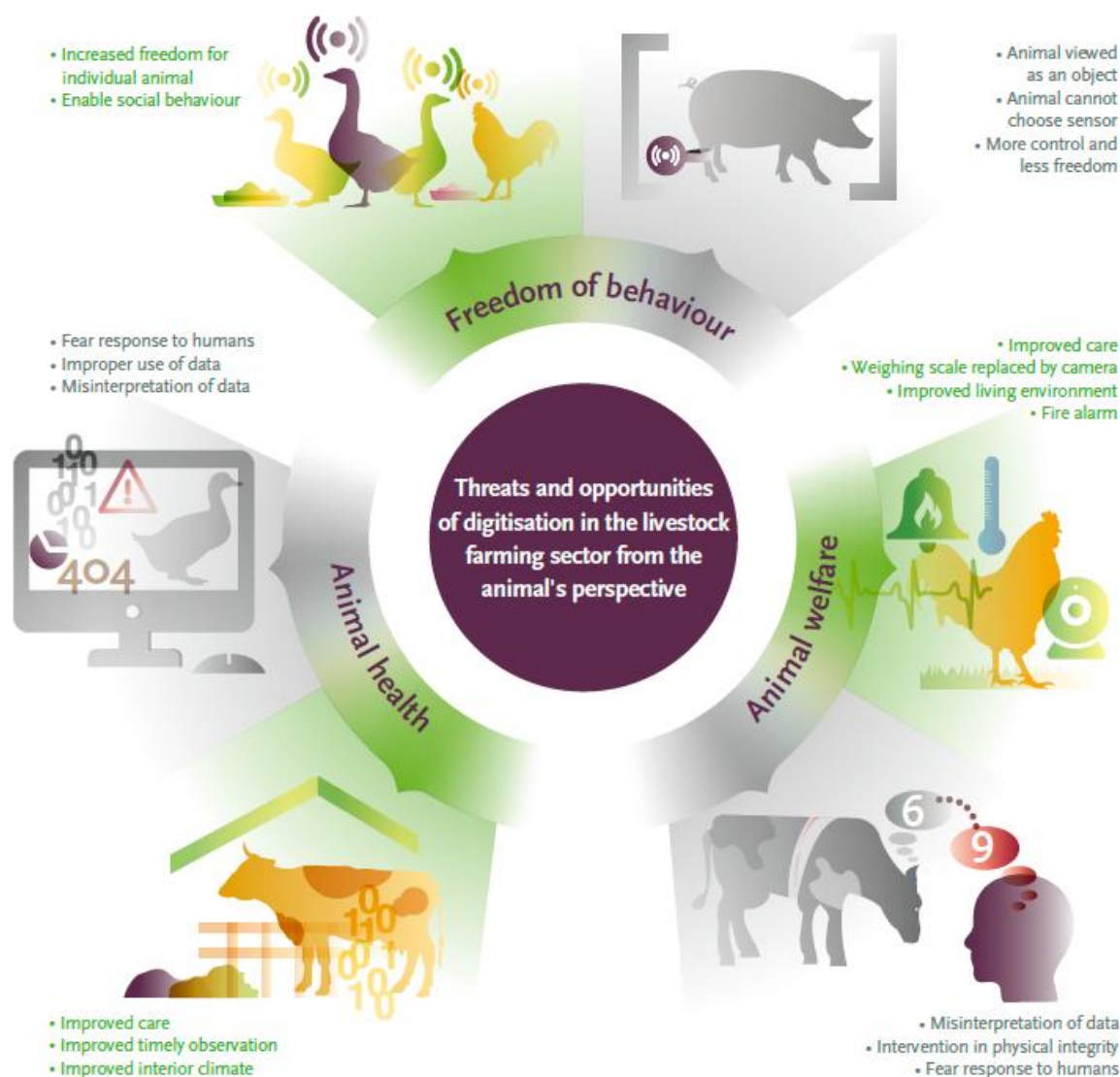
Figure 1: Opportunities and threats of digitization in the livestock farming sector from the perspective of the animal.

The collected data are used for drawing attention to possible deviations (e.g. diseases or abnormal behaviour) in a timely manner, facilitating faster interventions and allowing problems to be avoided. Sudden unusual water intake, for example, is an indication of emerging disease issues. The ability to detect diseases at an early stage and provide animals with targeted treatment before a disease takes hold also contributes to low medication usage. As a further example, early alerts that an animal is starting to bite or peck other animals can allow examination of the possible underlying causes sooner so that they can be addressed, by boosting enrichment components in feed, for instance, or by eliminating other stress factors. If necessary, technology can enable problems that occur anyway to be resolved more quickly, for instance by removing a biter or pecker from the group.