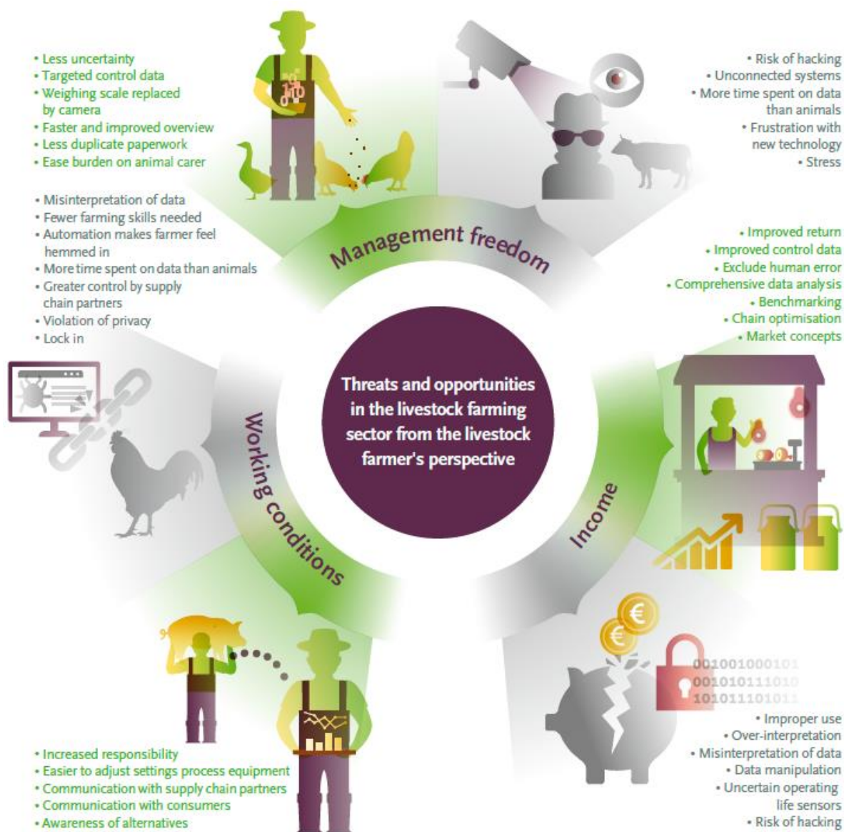
Figure 2: Opportunities and threats of digitization in the livestock farming sector from the perspective of the livestock farmer.