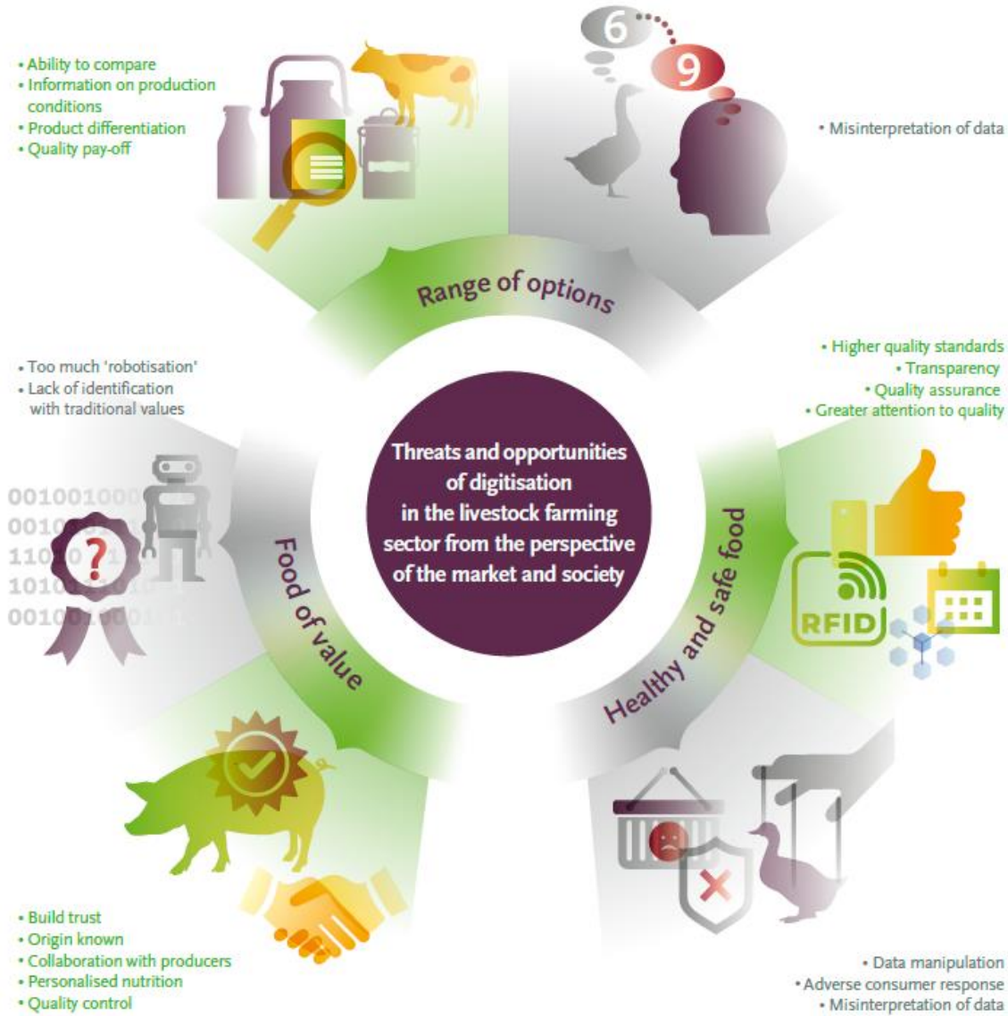
Figure 3: Opportunities and threats of digitization in the livestock farming sector from the perspective of the market and society.

The availability of more data about the composition of food leads to an increased risk of misinterpretation by consumers. Digitisation that focuses more on consumer food choice behaviour itself probably has a more positive impact than extending labelling guidelines. More and more apps with this focus are also becoming available.